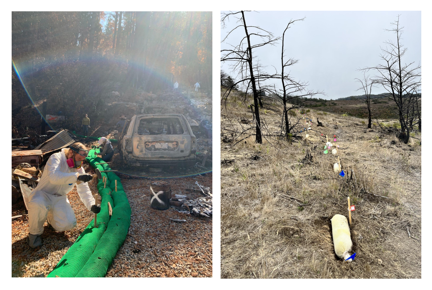
Photos: PFMI wattles deployed around a structure fire (left), and in a burned woodland (right)

If the burn was low-intensity (e.g. a prescribed fire or a fire in a grassland or a previously managed site with low fuel load), the soil microbial community likely did not face high mortality and will recover quickly. In this case, no PFMI treatment would be necessary, but you could add carbon resources (e.g. an uninoculated wattle) to provide an easily accessible food source for those local soil microbes. If the burn was high-intensity (e.g. a wildfire that burned a wooded/forest area), then soil microbial communities may take decades to recover to their pre-burn levels of complexity and may greatly benefit from PFMI to kick-start the recovery process.