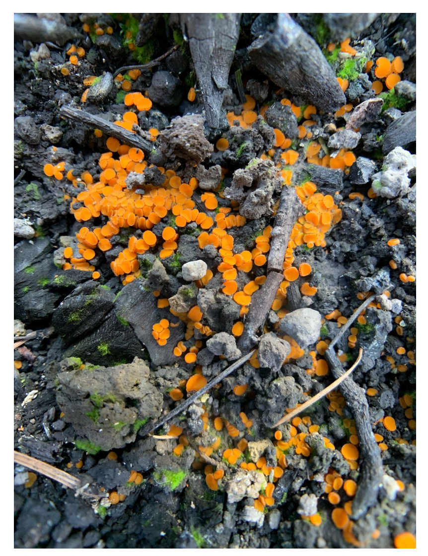
Photo: Fungi and other microbes are first on the scene after fire combusts vegetation; they kick-start successional processes that govern ecological resilience to disturbances. However, not all microbes are able to metabolize products of fire (e.g. ash, charcoal & "biochar"). Certain "pyrogenic" fungi have evolved to consume these post-fire resources and this ability is considered to be a fire-adapted trait. Here you can see these bright beauties hard at work in the field! They are likely a species of genus Anthracobia from the family Pyronemataceae .

For our FENiXS study, we constrained ourselves to rigid protocols in order to reduce bias in our experimental design. Ultimately there are many ways these methods can be employed, and the protocols outlined below are merely guides for you to follow and adjust based on your land and resource scenarios. We encourage you to experiment (after you have done your homework) and report back to us your experiences and observations.