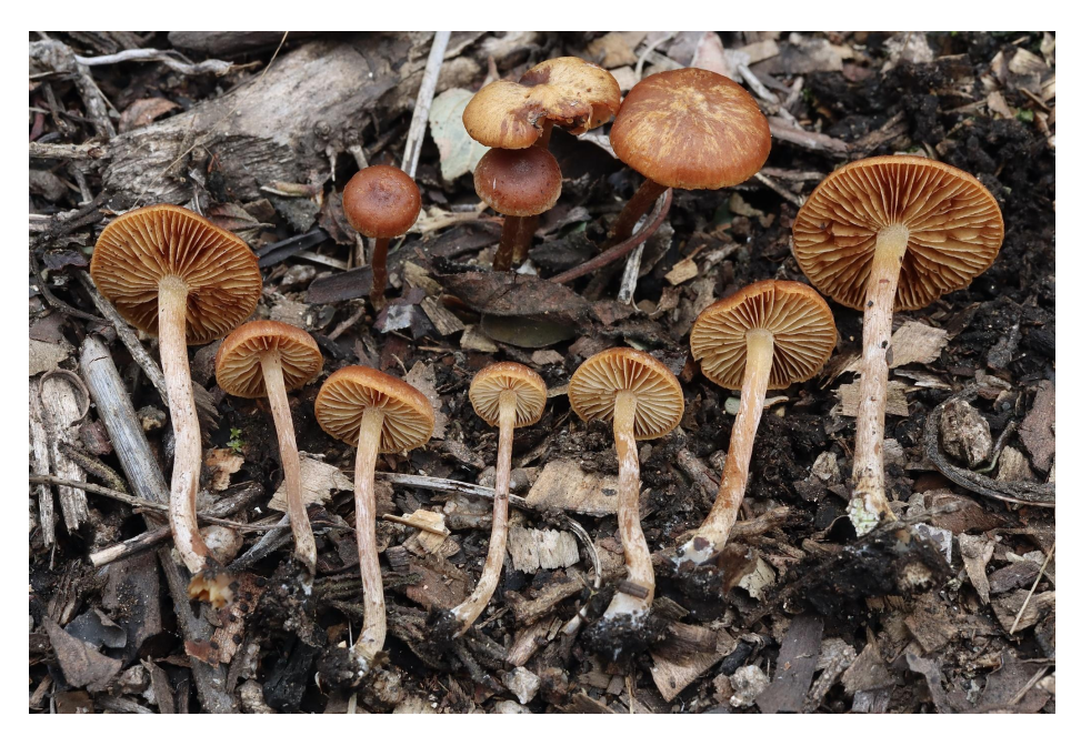
Photo: These specimens of Crassisporium funariophilum were found growing in soil on the side of a trail within San

When using PFMI as a restoration tool, several factors are to be considered for successful and ecologically beneficial inoculation (10, 11). In some situations, there are risks to altering the soil biology of an area and caution is necessary (12, 13). In this guide we outline the major factors one should consider when deciding to use PFMI, primary methods used, and detailed protocols for each.